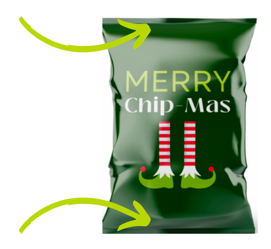
At the open ends of the chip bag, use a stapler to attach the paper together. Staple the top and bottom edges, making sure the bag is securely sealed.