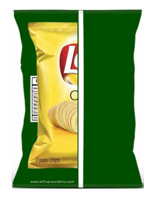
Wrap the printed paper around the bag of chips. Make sure the design aligns properly, and the paper covers the entire bag.