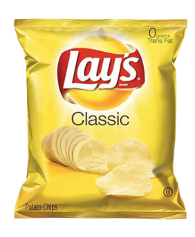
Grab a bag of your favorite chips.