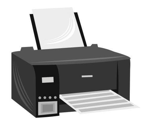
Start by printing the chip bag file on a sheet of letter-sized glossy paper.